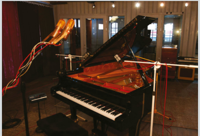
Toontrack have spared no expense capturing the sound of the Fazioli